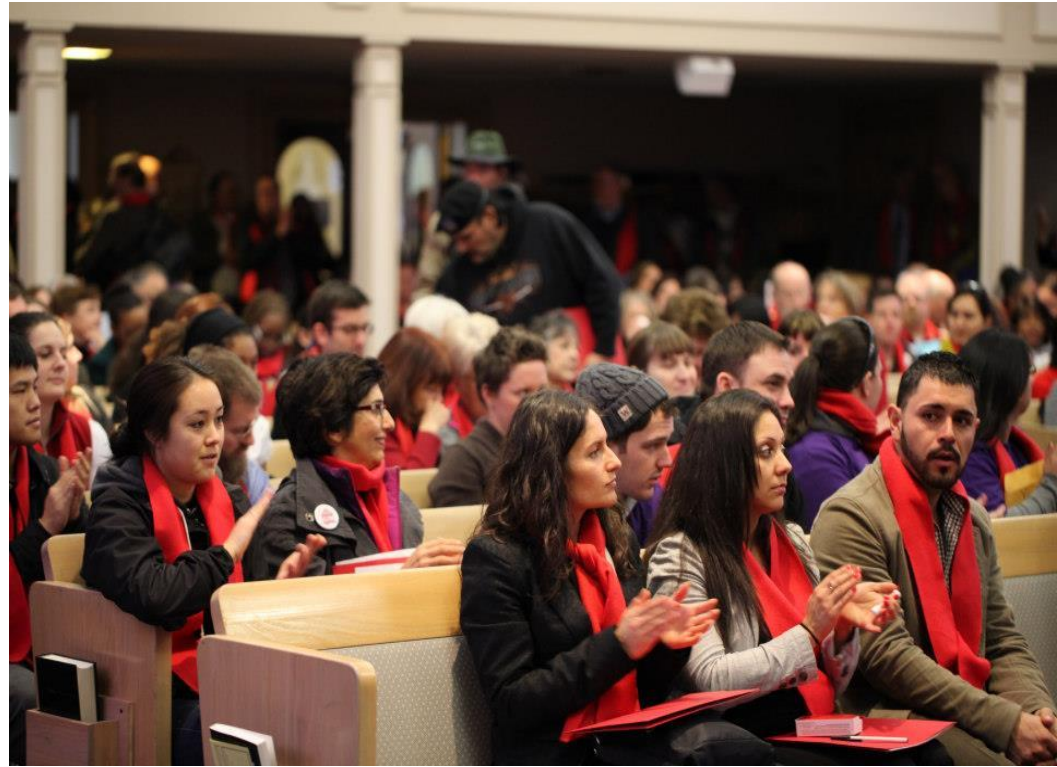
Advocates at the Morning Call to Action, HHAD 2014.